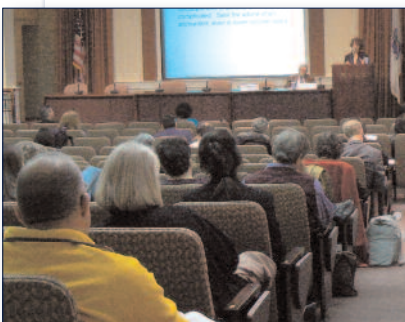
Nearly 11,000 customers attended MCLE programs in person during the past year, while an additional 11,000 opted for online or audio programs.

In addition, throughout the year, MCLE has been privileged to assist the Probate and Family Court in educating both court staff and the bar on two ongoing initiatives. This was the third year in which MCLE partnered with the Court to offer programs throughout the state on the implementation of the new Massachusetts Uniform Probate Code, one of the most significant pieces of legislation in the past 25 years, which goes into effect on March 31, 2012. In addition to training thousands of lawyers